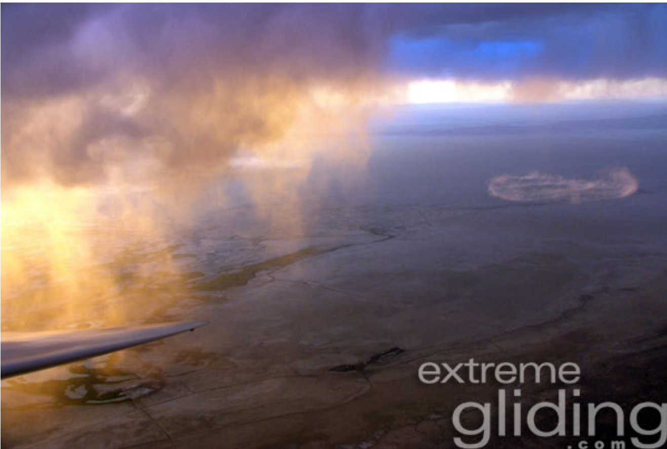
Soaring near Fallon (east of Reno Nevada) in OD conditions