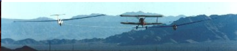
"Houston, we have a p..."