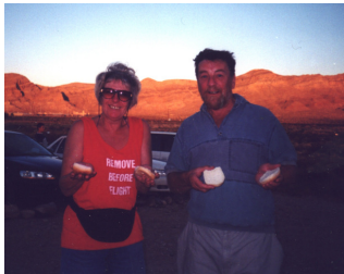
"This is like when Chuck Yeager pulled out the X-1"