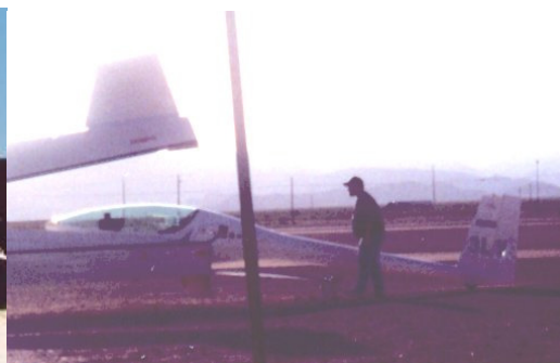
"We should have put a rock cairn at Austin for you."