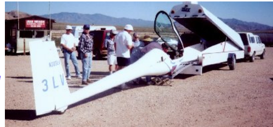
"My stress level is down to zero."