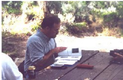
"Chili dogs are a camping tradition."