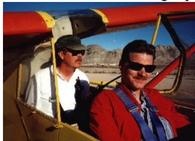
"You're going to miss all the excitement!"