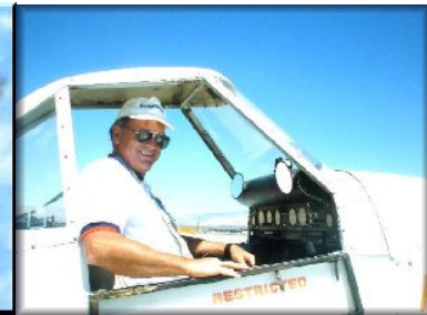
"It never gets hot in Sandy Valley."