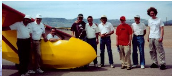
"Well, welcome to the clan."